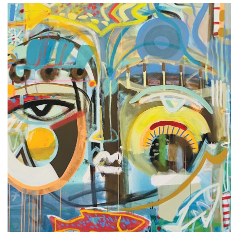
Sally King Benedict

HEMMINGS GALLERY 208.254.1097 hemmingsgallery.com